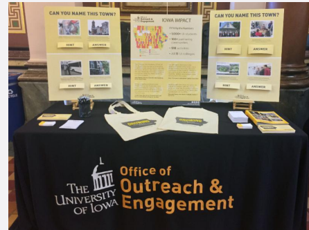
The Office of Outreach & Engagement participated in Hawkeye Caucus Day, along with over 30 UI departments.

IISC recently traveled with the Office of Outreach & Engagement and over 30 other University of Iowa departments to the state capitol building in Des Moines for the annual Hawkeye Caucus Day. The UI's reach and statewide impact were common themes among the vibrant booths, posters, and conversations throughout the capitol rotunda, and the many colorful maps indicated that the UI has impact in all 99 Iowa counties. IISC's objective during Hawkeye Caucus was to communicate to state legislators our specific focus on "engagement". When speaking with legislators and their staff, we hope to convey the value to their constituents of mutually beneficial partnerships between IISC and Iowa communities. Through collaborative partnerships, IISC works "with" communities on relevant social, economic, and environmental projects while offering engaged-learning experiences that better prepare UI students for their future careers.