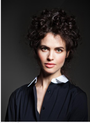
Neri Oxman presents Everything is Connected on April 20.

faculty, staff, and students together to celebrate successes, inspire new creations, and encourage networking for future collaborations.