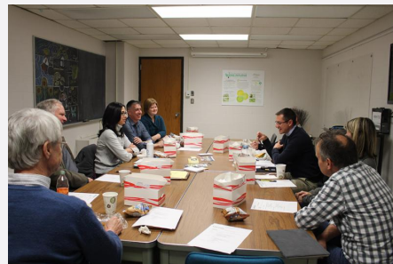
The IISC Advisory Board hard at work during their December meeting. The advisory board helps support the vision and direction of the program. Thank you for your continued guidance!

Among their key roles and responsibilities, IISC Advisory Board members primarily serve to provide support and advice to help guide and evolve the program so that IISC can best fulfill its dual mission of "enhancing sustainability in Iowa while transforming teaching and learning at the University of Iowa". The IISC Advisory Board is comprised of influential faculty, staff, and administrative representatives from across campus whose experiences, connections, and expertise help connect IISC to a broader society. IISC is very excited that, at the December meeting, the board members recognized an opportunity to bring additional perspectives to the group by approving expansion of the Advisory Board to include student and community partner representatives. These new faces will further ensure that IISC projects and services have significant and relevant impacts that align with the ever-changing needs of both UI students and Iowa communities. This evolution of the IISC advisory leadership demonstrates IISC's continual pursuit of excellence and our proactive approach to strengthening relationships with community and campus partners. Stay tuned for announcements about new faces to the board!