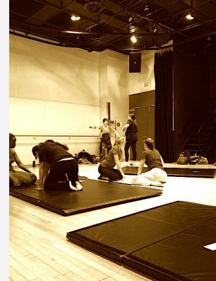
The 2017-18 Interdisciplinary Performance Fellowship will be in the Department of Theatre Arts.

The Grant Wood Fellow application window for the 2017-18 academic year opens this month. The Grant Wood Fellowship program provides three one-year fellowships in painting and drawing, printmaking, and interdisciplinary performance. The university selects fellows through a national competition each January for the following academic year. The School of Art & Art History will post the painting and drawing and printmaking fellowships soon. The performing arts fellowship rotates between the three departments in the Division of Performing Arts: the Department of Dance, the Department of Theatre Arts, and the School of Music. The Department of Theatre Arts is currently seeking emerging mid-career actors and directors. Visit the Grant Wood Art Colony website for updates and more information.