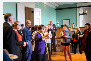
It's not too early to get involved in the spring 2017 Theme Semester!

Our Lives Online, the spring 2017 Theme Semester about the Internet and technology, explores the global system of connectedness, networks, and collaboration discovered in the past and emerging in the present and future. As the University of Iowa embarks on a new academic year, individuals are encouraged to download and print off one of the posters and show support for the spring 2017 Theme Semester!