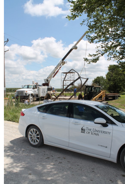
Arts Share is working with IMU Marketing + Design to create a video about the barn sculpture in Keosauqua, Iowa.

an educational component as well, and will demonstrate the value of the small farmer as well as agricultural-based communities.