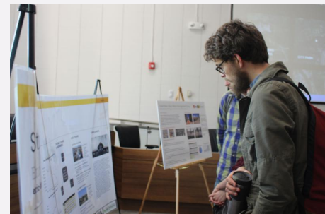
Members of the public learn about projects during the IISC-Iowa City partnership celebration in May.