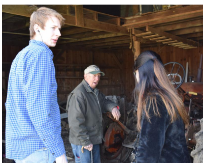
Project Highlight: Non-fiction film students interview farmers in Van Buren County. Watch the films created