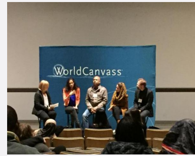
Just Living Event Spotlight: World Canvass was a part of the two day social justice symposium with various events and activities.

Students, faculty, staff, and community partners have the opportunity to get involved with the Just Living Theme Semester. Learn about the opportunities that await throughout the semester.